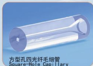
方型孔四光纤毛细管 Square-Hole Capillary