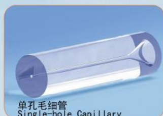
单孔毛细管 Single-hole Capillary