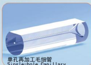
单孔再加工毛细管 Single-hole Capillary