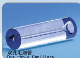
双孔毛细管 Dual-hole Capillary