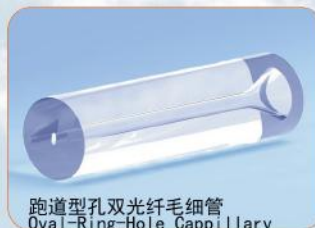
跑道型孔双光纤毛细管 Oval-Ring-Hole Capillary